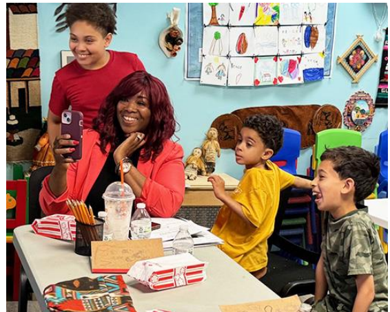
Photo below: Parents of the movie-makers were invited to the premiere and are obviously delighted with the results!