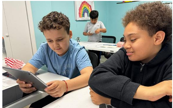
Photo above: These young brothers - future movie directors - take their story telling projects very seriously. Here they are reviewing one of their films.