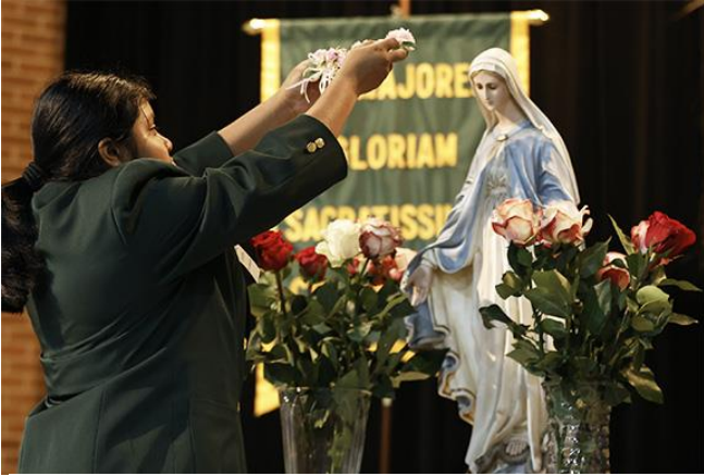
Crowning Mary during the month of May is a much beloved rite of spring at Cabrini High School.

Springtime always brings a flurry of events and traditional activities at schools. At Cabrini High School in New Orleans, they recently held the May Crowning Mass where they announced three groups of awards to our school community members.